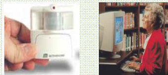
Motion sensors placed in home to track activity

If not computer literate, subjects are trained with a 6-session standard curriculum. Subjects respond to weekly on-line health and activity questionnaires. Secure web-based software allows remote management of longitudinal data streams, the status of the sensor net and seniors.