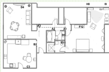
Strategically placed arrays of passive infra-red motion sensors, contact door sensors, and home PC.